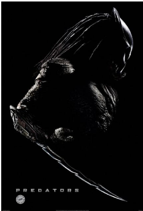
The most dangerous killers on the planet... but this is not our planet.

We are heading into Halloween season, so DVD shelves will be loaded with cheap, direct-to-DVD horror flicks. Some bigger-name productions are coming as well, but for the most part DVD releases will be few for the remainder of the month. "It's Christmas, Buy Our Stuff" nonsense throttles up soon—can already see titles appearing on Amazon.com.